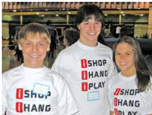
Members of the Teen Transit Advisory Board help spread the word about iRide at the AIM exposition.