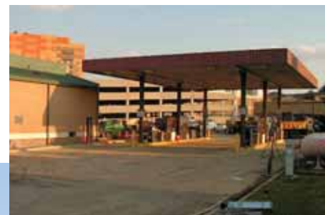
ART's new compressed natural gas refueling site.

The CNG site represents one very important piece of ART's long term plan to build an infrastructure to support the future of Arlington Transit." ■